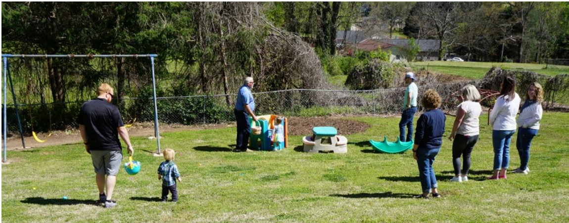
Toddlers looking for Easter eggs and playing on the playground!