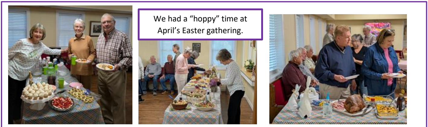
We had a "hoppy" time at April's Easter gathering.