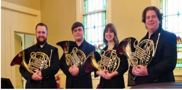
Palm Sunday service featured beautiful French horn music provided by "NGU Horn Studio" from North Greenville University.