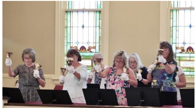
The Belles of Landrum ringing